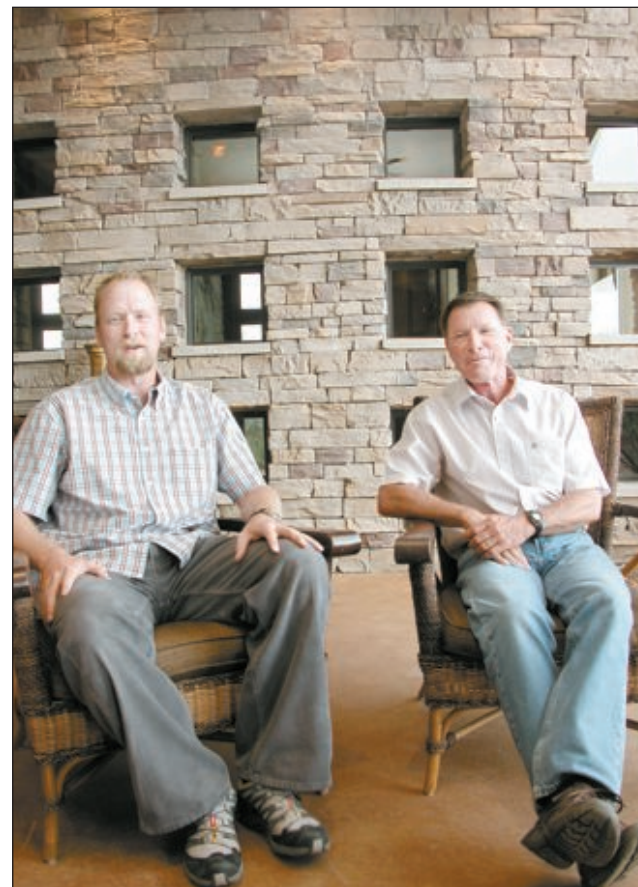
STEVE MACINTYRE | The Las Cruces Bulletin

Working together off of each other strengths, the two