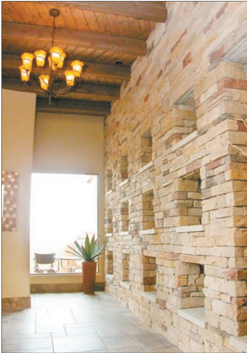
Offering those who enter the home an enticing view of the back patio, Jim and Cole Pofahl included many small windows in the entry's large rock wall.