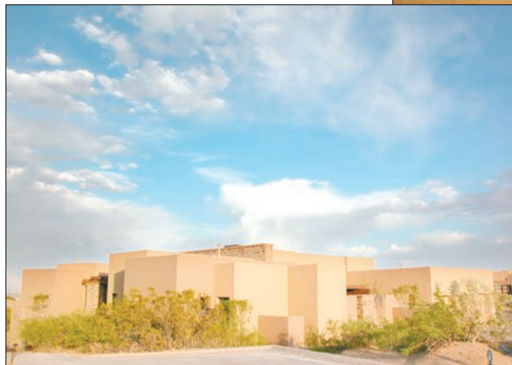
Found in the Picacho Mountain subdivision, this home has great valley and mountain views.