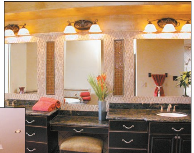
With the look of a luxury hotel, the master bathroom includes a large vanity and jetted tub, with a garden just outside the large walk-in shower.