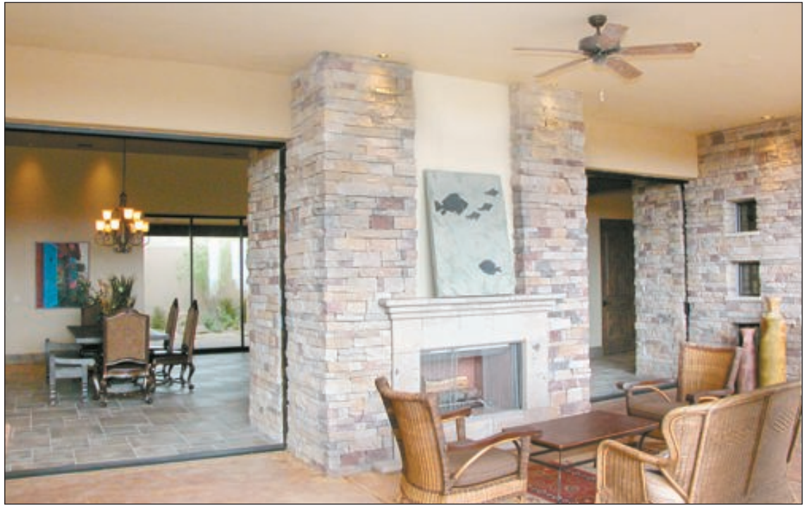
With the push of a button, the home's glass walls disappear, transforming the main living area into a comfortable outdoor space.