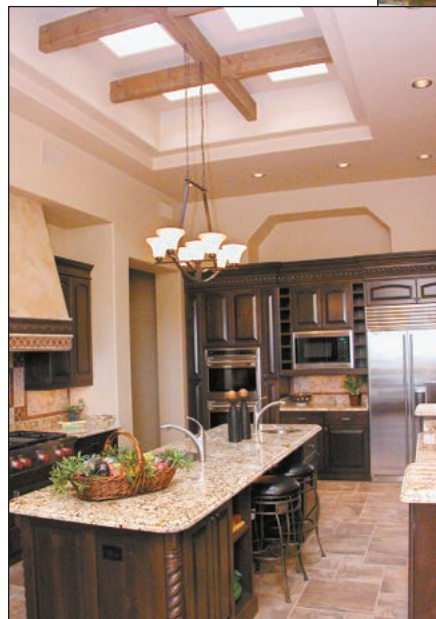
The home's gourmet kitchen includes custom wood flooring, a custom-built range top and hood as well as granite countertops and a large island.