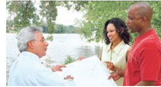
Agent/Builder Directories 104 Property Management 104 - 105

1100 S. Main, Ste. 113 in the Pueblo Plaza 575-526-4224 • Fax: 575-526-4225 email: graphics@zianet.com • www.REPress.com