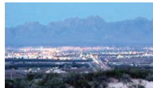
City Map 108 - 109