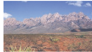
Land & Lots 106 - 107